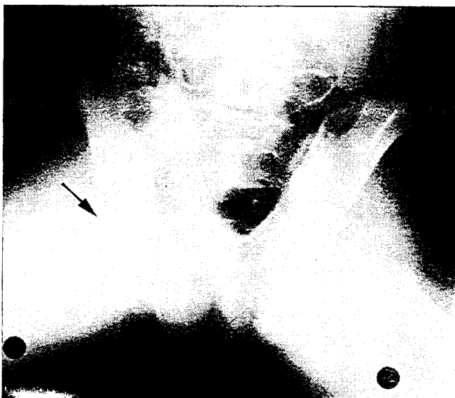
FIG. 1. Two weeks after the onset of pain, the radiograph shows no evidence of a slipped capital femoral epiphysis. There is an area of possible osteomyelitis adjacent to the epiphyseal plate (arrow).

At follow-up, 2 years postoperatively, the boy was free of pain. He had a Trendelenberg lurch and a leg-length discrepancy of 2 cm. The range of motion of the right hip was 15° of adduction, no abduction, 35° of exter-